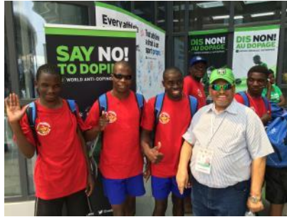
Athletes with WADA Vice President, Amb. M. A. Stofile