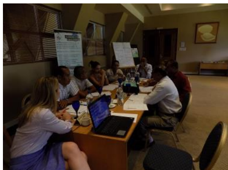
Indian Ocean RADO – Education training in Mauritius, 14-15 October 2015