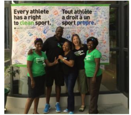
WADA Outreach team