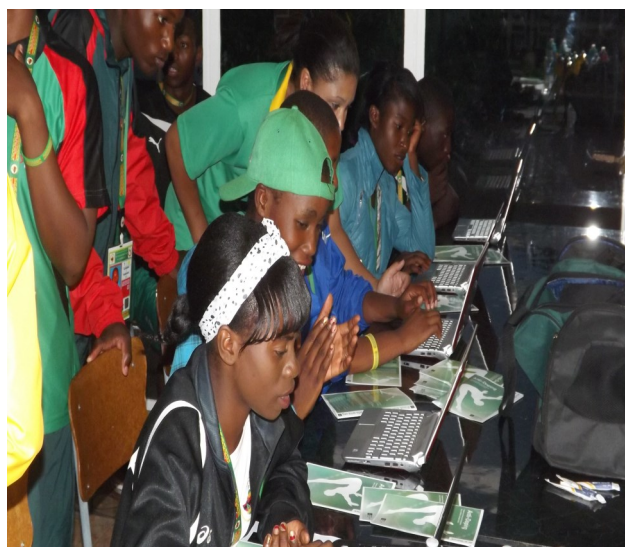
Young athletes enjoying the anti-doping quiz on the laptop computers at the Outreach Booth during the Games