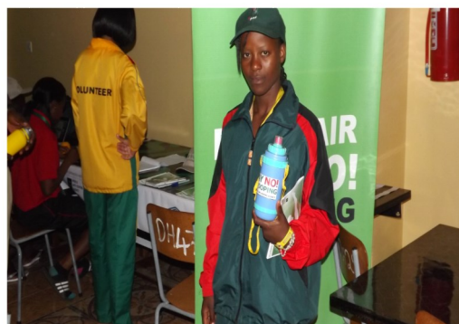
Young athlete —representing Malawi with pride