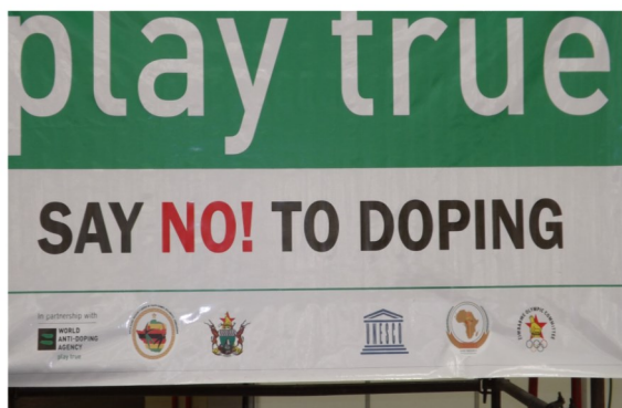
Clear Message for the Games