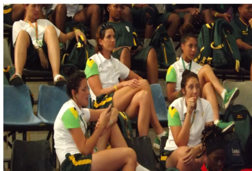
South Africa -The Rainbow Nation —well represented