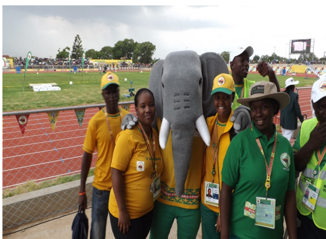
Doping Control Officers (DCOs) having a nice time with popular games mascot, Jumbo, at the White City Athletics Stadium in Bulawayo