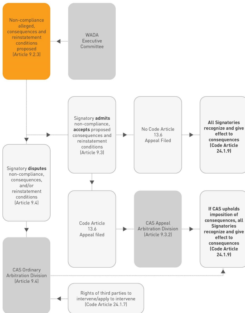
Figure Two: Flow chart depicting the process following a formal allegation of non-compliance (Articles 5.3.1, 5.3.2 and 5.3.3)